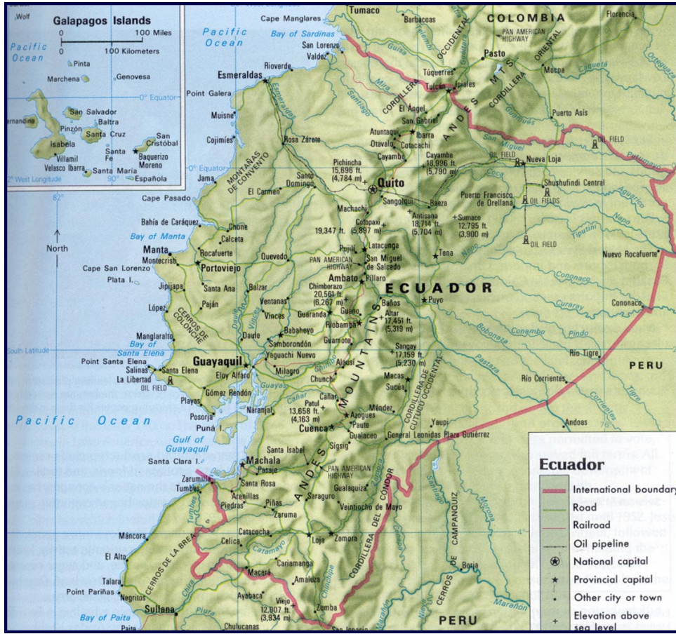
Ecuador, South America